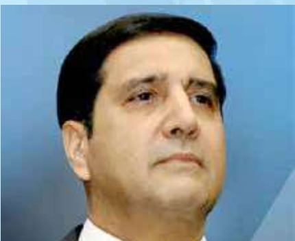
ADMIRAL R K DHOWAN

Strategy and Management, University of Brussels