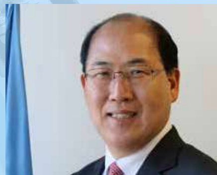
MR. KITACK LIM Secretary General-International Maritime Organization