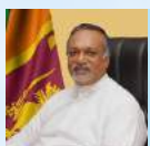
HON RAVINDRA SAMARAWEEERA Minister of Sustainable Development and Wildlife, Sri Lanka