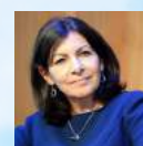
ANNE HIDALGO Mayor of Paris and Chair of C40