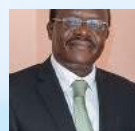
DR. MUKHISA KITUYI Secretary General, United Nations Conference on Trade and Development (UNCTAD)