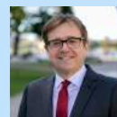
HON. JONATHAN WILKINSON Minister of Fisheries, Oceans and the Canadian Coast Guard