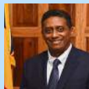
H.E. (MR) DANNY FAURE President of the Seychelles