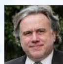
H.E. MR. GEORGIOS KATROUGKALOS Alternate Minister, Ministry of Foreign Affairs, Greece