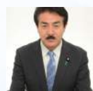
H.E. MR. MASAHISA SATO The State Minister for Foreign Affairs of Japan