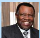
H.E. HAGE GEINGOB President of Namibia