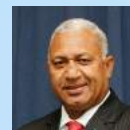
H.E. FRANK BAINIMARAMA Prime Minister of Fiji