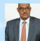
H.E. MR. ELDIRDIRI MOHAMMED AHMED Minister for Foreign affairs, Sudan