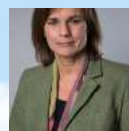
ISABELLA LÖVIN, Minister of International Development Cooperation and Climate, Sweden