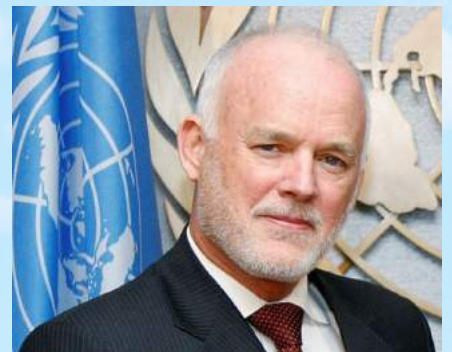
AMB. PETER THOMSON UN Secretary-General's Special Envoy for the Ocean