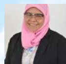
MAIMUNAH MOHD SHARIF Executive Director-UN-Habitat