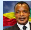
H.E DENIS SASSOU NGUESSO, President of Congo