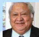
H.E. LUPESOLIAI SAILELE MALIELEGAO TUILA'EPA Prime Minister of Samoa