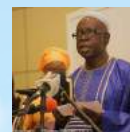
MR JAMES F. P GOMEZ Minister of Fisheries and Water Resources, Gambia