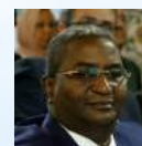
MR ABDELKADER BENMESSAOUD Minister for Tourism and Handicraft Industry, Algeria