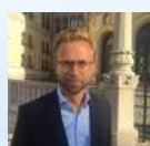
MR. NIKOLAI ASTRUP Minister of International Development, Norway