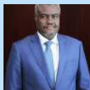
H.E. MOUSSA FAKI MAHAMAT Chairperson, African Union Commission Chairperson