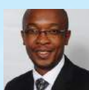
MR. MPHO PARKS TAU President of United Cities & Local Governments (UCLG)