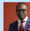
H.E. DR. EMMANUEL IBE KACHIKWE Minister of State for Petroleum, Nigeria